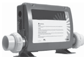
This document covers VS and GS systems 500DZ through 520DZ with Balboa Panels VL801D or VL802D. http://www.balboawatergroup.com/

When the spa is first powered up, the words SET TIME will flash on the display. Press “Time,” then “Mode/Prog,” then “Warm” or “Cool.” The time will begin changing in one-minute increments. Press “Warm” or “Cool” to stop the time from changing. Press “Time” to confirm.